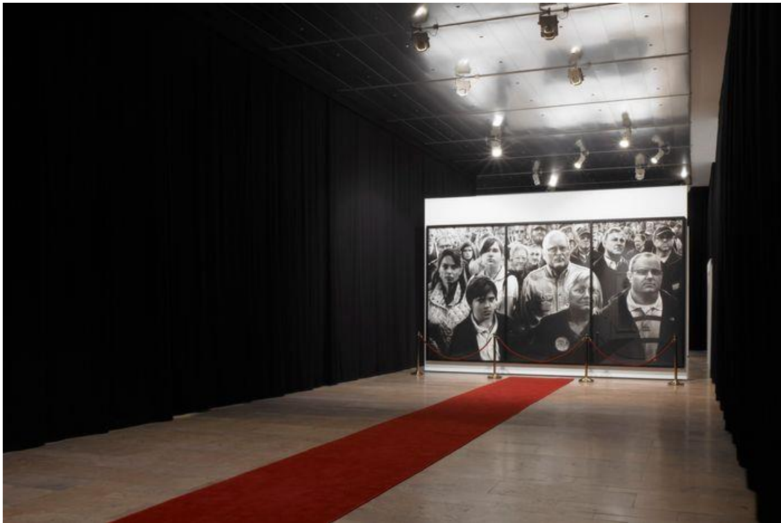
Robert Longo’s illustration of Newt Gingrich supporters, based on 2012 New York Magazine photograph by Christopher Anderson.

This isn’t the first time Longo and New York’s paths have crossed. In 2012, following the release of a New York cover story by John Heilemann and Jonathan Chait on the GOP primary, Longo created a work based on a photograph by New York’s photographer-in-residence at the time Christopher Anderson featuring Newt Gingrich supporters listening to his stump speech at a campaign event in South Carolina.